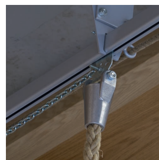
Standard locking system